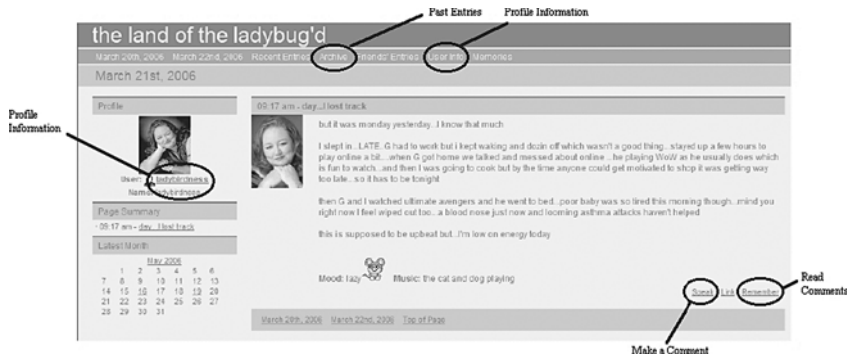
FIGURE 1. Visual layout of a typical LiveJournal blog

'reading' blogs – the content of blog pages. It is almost like one needs to learn not only how to read blogs but also how to view them.